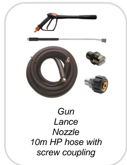
Gun Lance Nozzle 10m HP hose with screw coupling